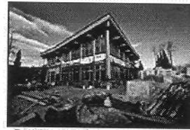
Red Pine adds 175 more seats!