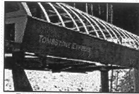
Tombstone is now a 6-pack